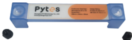
Cover, with datasheet