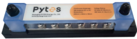
Busbar 300 A 2P with 12 screw terminals, with cover