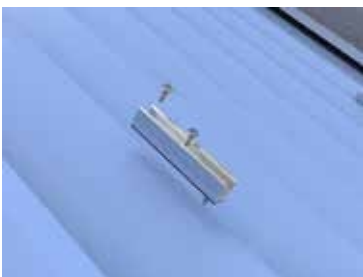
Secured the mini rail along with the roof ridges with tapping screw(6.3x25)