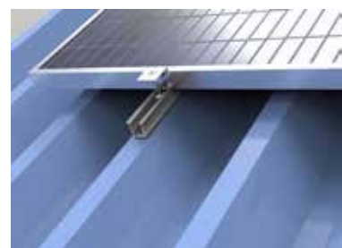
Fixing the panels on rails by mid clamps