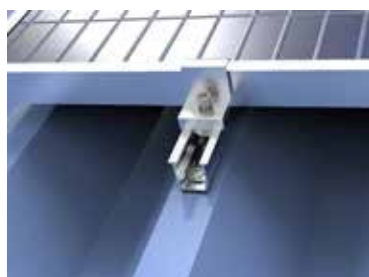
Fixing the panels by end clamps