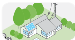
Residential grid-tie solar with backup power