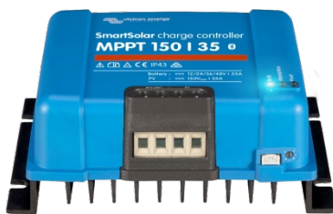
SmartSolar Charge Controller MPPT 150/35