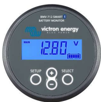
Bluetooth sensing BMV-712 Smart Battery Monitor