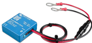
Bluetooth sensing Smart Battery Sense